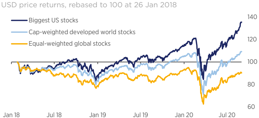
Source: Refinitiv, Orbis. Biggest US stocks: S&P 500 Top 50 Index. Cap-weighted developed world stocks: MSCI World Index. Equal-weighted global stocks: MSCI ACWI Equal Weighted Index, which peaked on 26 Jan 2018.

This report does not constitute a recommendation to buy, sell or hold any interests, shares or other securities in the companies mentioned in it nor does it constitute financial advice.